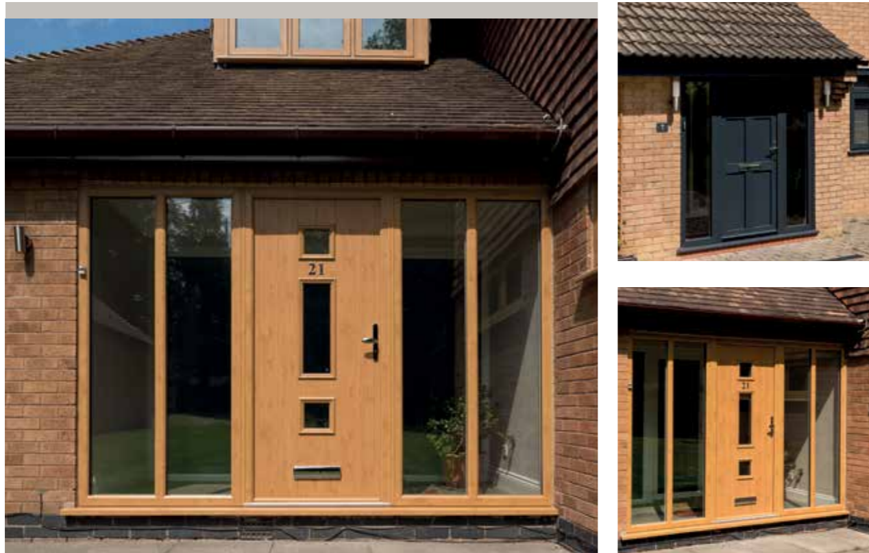
≡ Entrance door (with mid-rail) Double-glazed