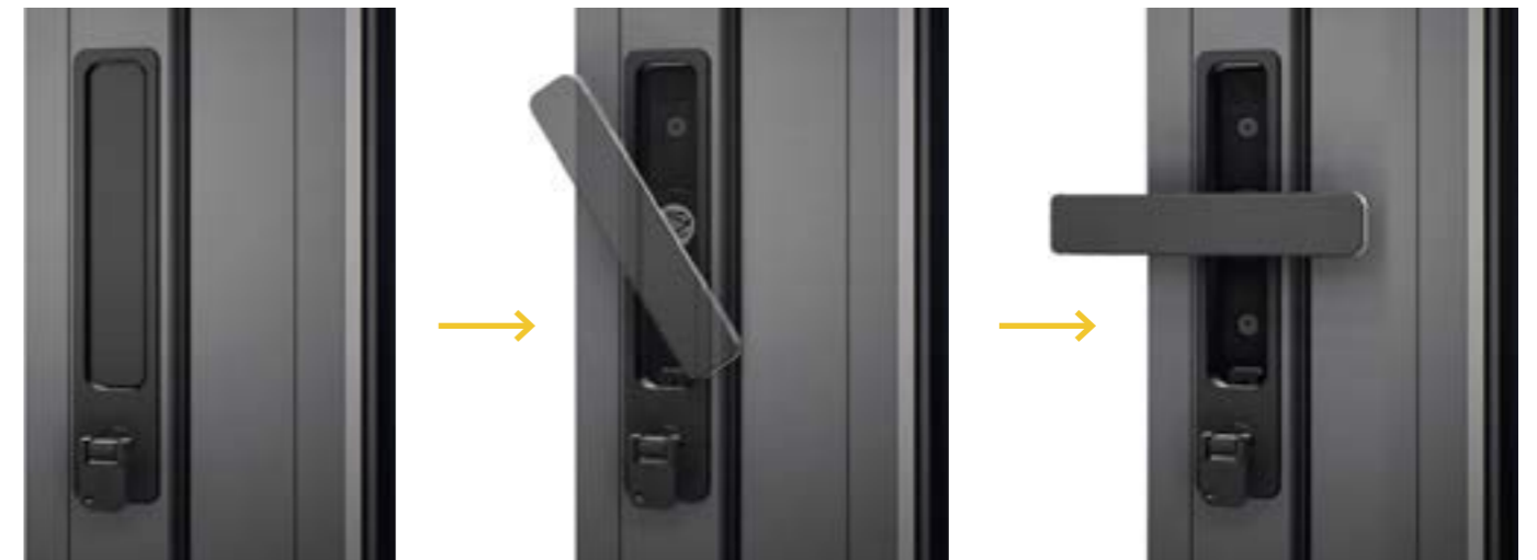
F82 Locking Jamb